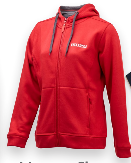
Womens Fleece Hoodie $56.40