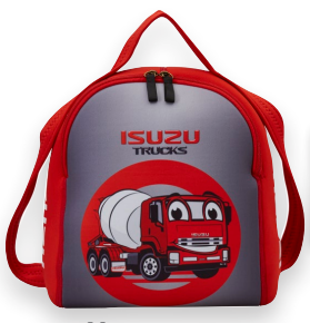
Neoprene Backpack $30.00