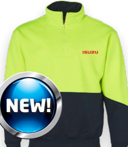
Hi-Vis Fleece Jumper $44.20