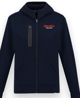
Neo Hoodie $68.85

Apparel available in various sizes. Contact your local dealer for more information.