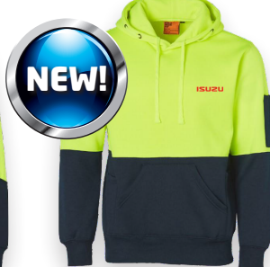
Hi-Vis Hoodie $46.20