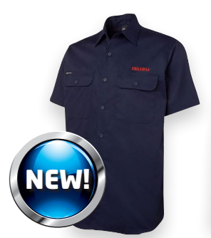
Short Sleeve Work Shirt $55.50