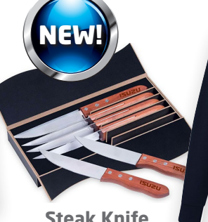
Steak Knife Set (6pc) $59.55